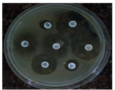
Fig 8: Antibiotic susceptibility testing