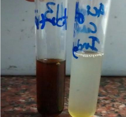
Fig 7: Nitrate reduction test Escherichia Coli (+Ve) &A. baumannii (-Ve)