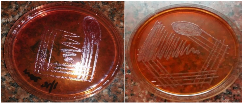
Fig 2 : Acinetobacter baumannii on MacConkey agar Fig 3 : Acinetobacter lwoffii on MacConkey agar