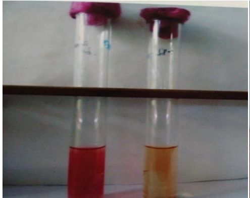
Fig 6 : Utilization of 10% lactose A. baumannii (+Ve) & A. lwoffii(-Ve)